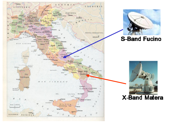
Fig. 4 – Location of PRISMA Ground Centres

A dedicated launcher will be used to directly inject the Satellite in its final orbit. The baseline is a VEGA launch, as alternative options, other small launchers such as Dnepr,