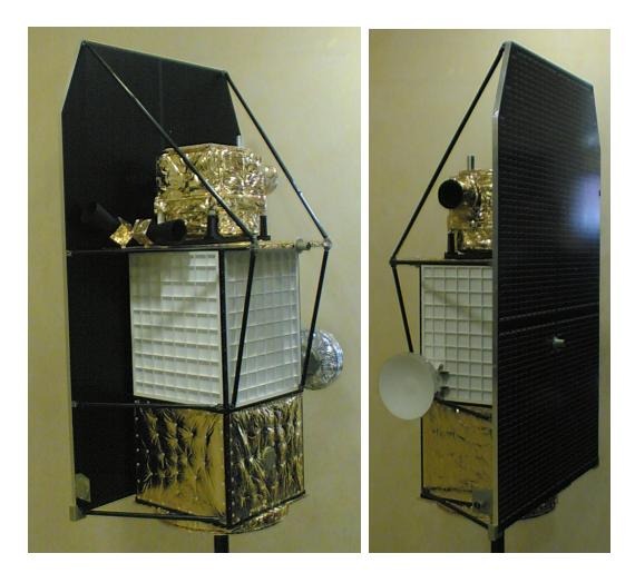
Fig. 3 – PRISMA satellite mock-up