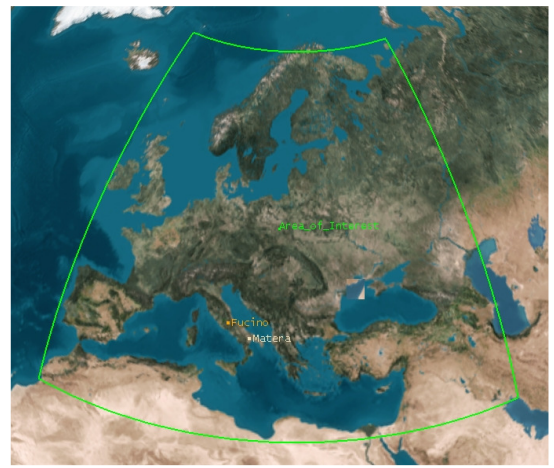
Fig. 5 – Area of interest

Considering the selected orbit, the daily accesses to the area of interest are usually 6. The average duration of the access to the area of interest is about 8.5 minutes.